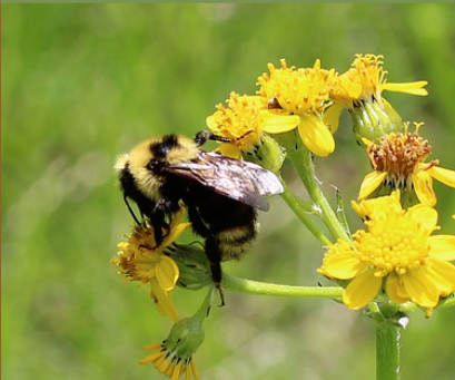
Indiscriminate Cuckoo BB