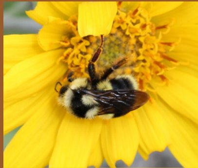
Nearctic Bumble Bee