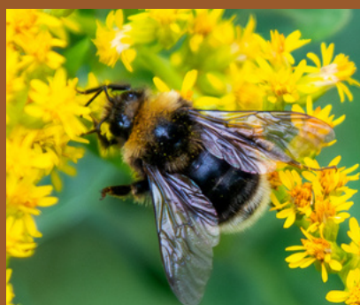
Western Bumble Bee