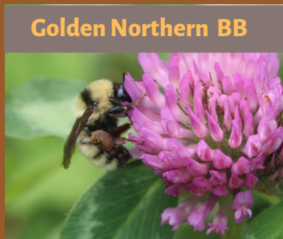
Golden Northern BB