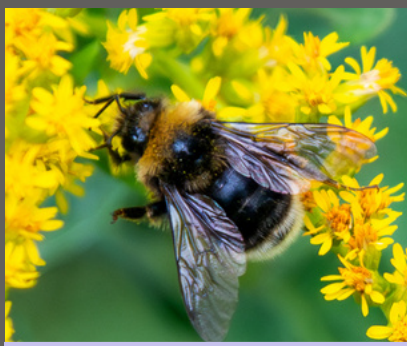
Western Bumble Bee