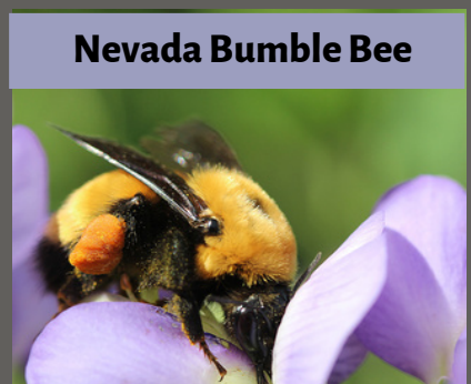
Nevada Bumble Bee

Take a walk in the park and look for beautiful bumble bees