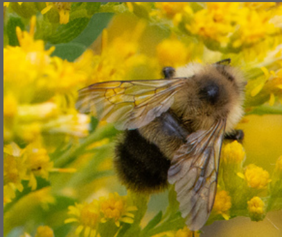
Half-black Bumble Bee