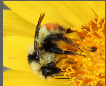
Central Bumble Bee