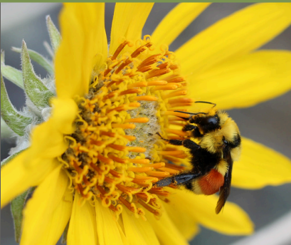
Hunt's Bumble Bee