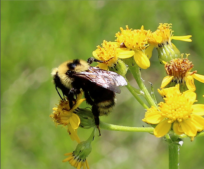
Indiscriminate Cuckoo BB